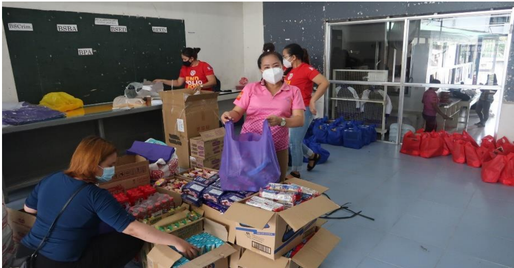
Re-packing of food items and school supplies to be distributed to the pediatric cancer patients of Davao Regional Medical Center and House of Hope residents