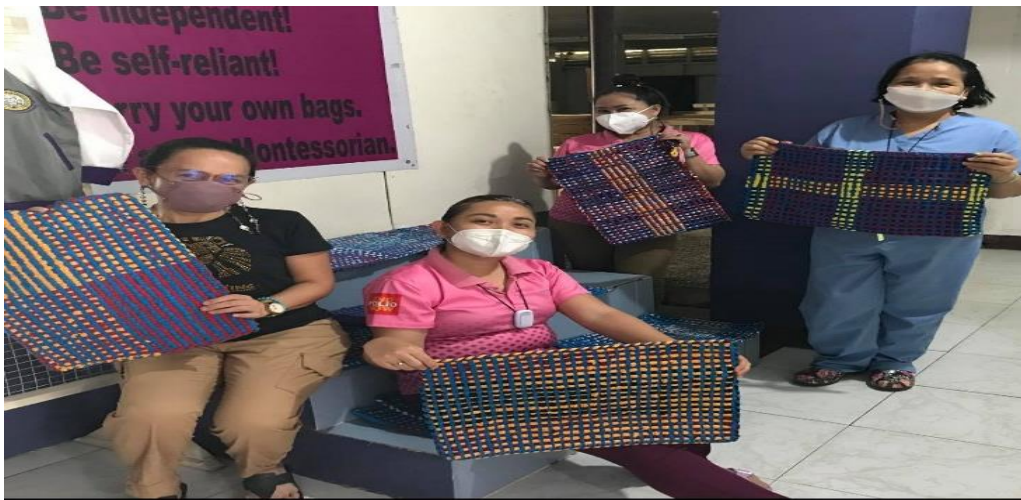
25 pieces of rags made by the beneficiaries ready for delivery to buyers